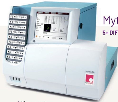
Mythic 70 NEW 5+ DIFF TECHNOLOGY