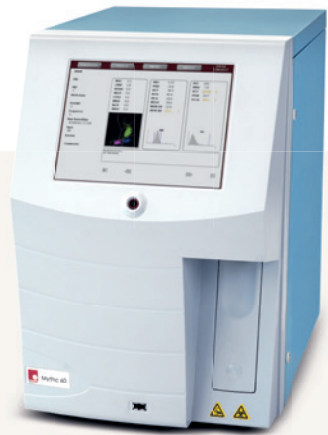
Mythic 60 5+ DIFF TECHNOLOGY